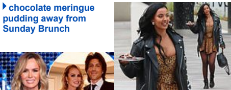
chocolate meringue pudding away from Sunday Brunch