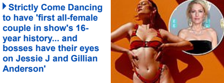
Strictly Come Dancing to have 'first all-female couple in show's 16-year history... and bosses have their eyes on Jessie J and Gillian Anderson'