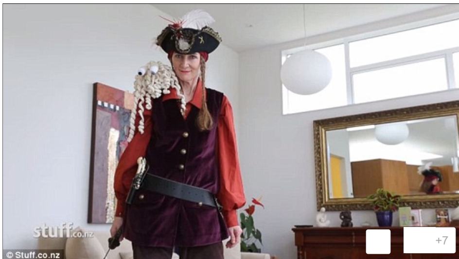
Pastafarians wear pirate clothing because they believe the Flying Spaghetti Monster created pirates