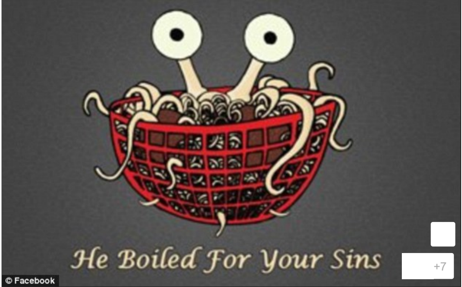
Members of the Church of the Flying Spaghetti Monster (the FSM) believe the world was created by the FSM

They also wear colanders on their heads to mark important occasions.